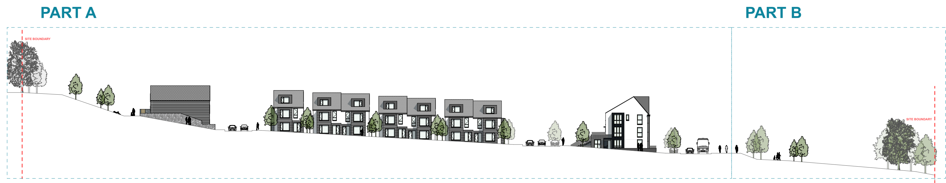
1:500 Contiguous Elevation F