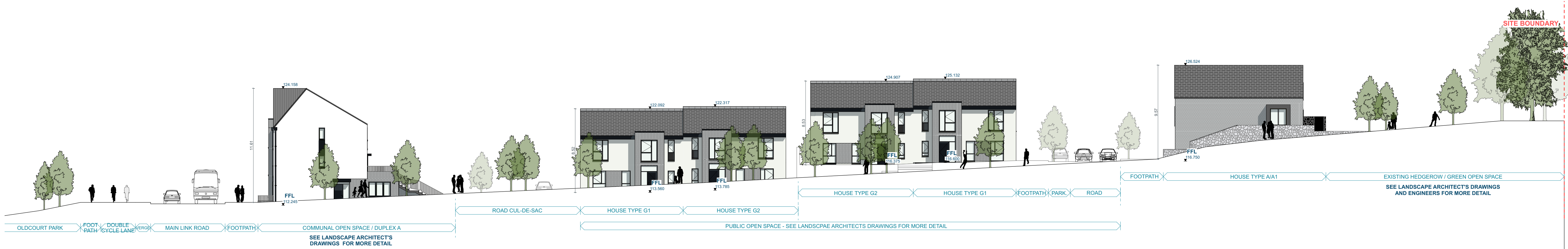
1:200 Contiguous Elevation E