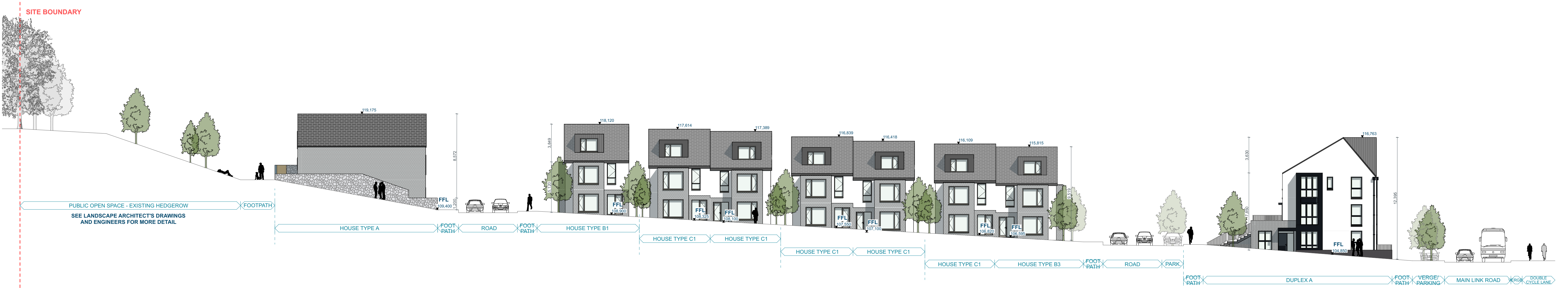
1:200 Contiguous Elevation F - PART A